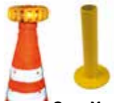
Cone Mount SPPULSARMAG