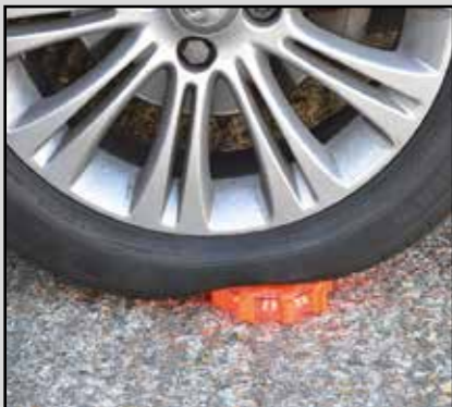
Crushproof, Up to 3 tonnes - shock resistant