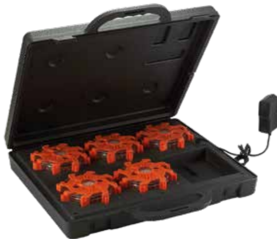
Recharges via inside charging case