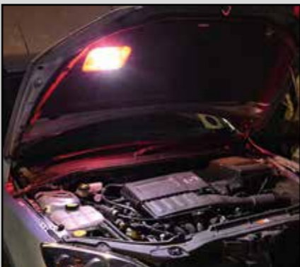
White flood light setting Strong magnetic back